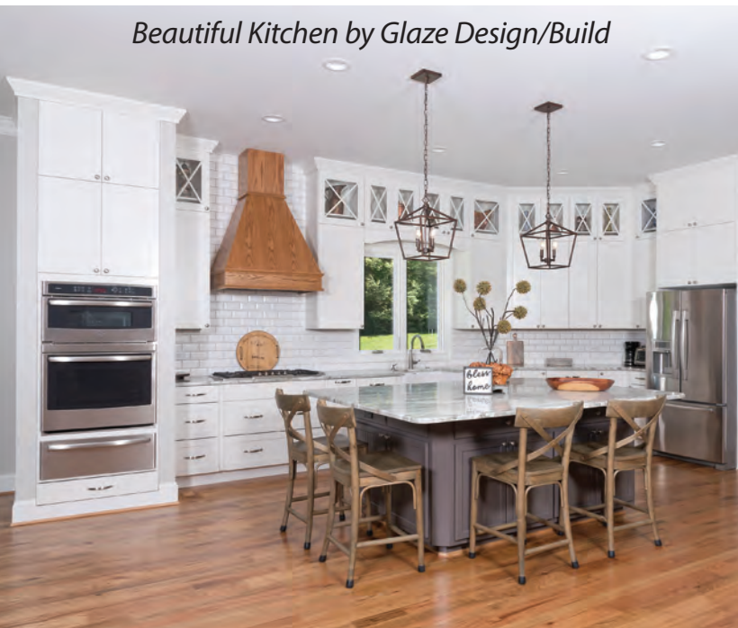
Beautiful Kitchen by Glaze Design/Build

So if you are thinking about adding on, or any other home improvement, visit glazedesignbuild.com or give us a call at (828) 324-9255.