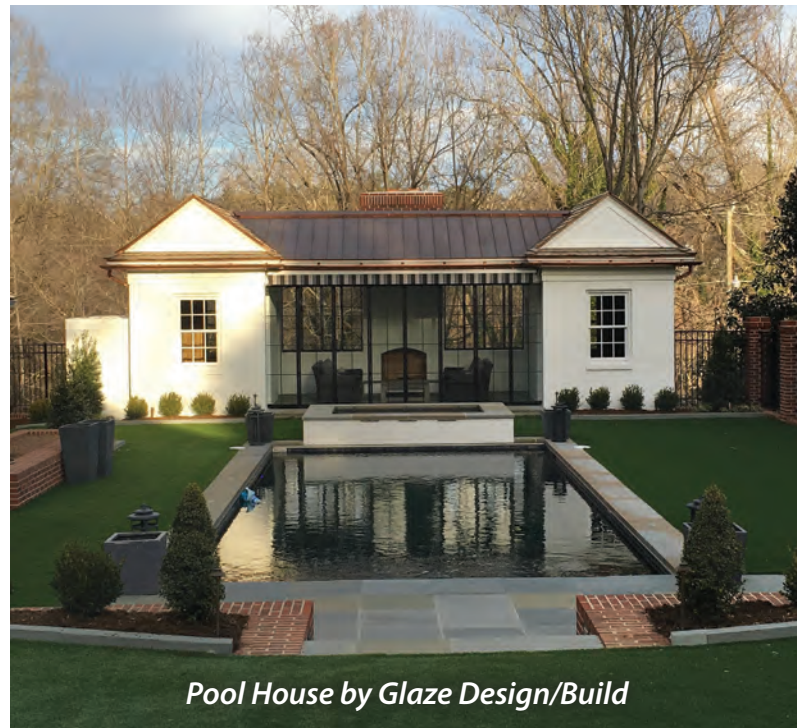
Pool House by Glaze Design/Build

Because we are a design/build company, we can help you with all the different phases of the process. From initial preliminary designs all the way through the actual construction of your project.