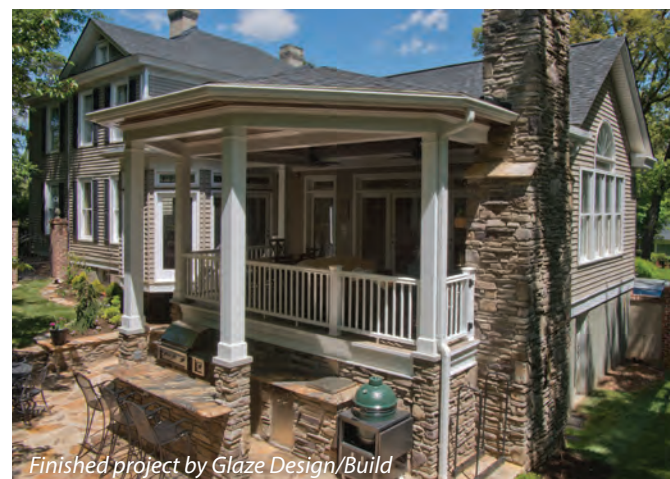
Finished project by Glaze Design/Build