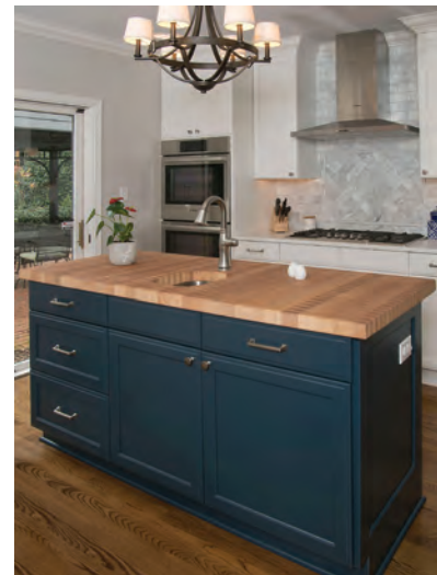
Mixed countertop kitchen remodel by Glaze Design/Build.

While a wood countertop isn't right for every person or every home, it is a unique design detail that is sure to make your kitchen stand out.