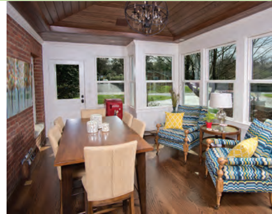
Beautiful sunroom addition by Glaze Design/Build.

During the Spring/Summer months, and, in our temperate climate even the Fall, homeowners love spending time outdoors on their patio or deck with friends and family. For really warm days, however, they also like having a conditioned space in their home where everyone can be comfortable and still enjoy the surrounding landscape. That is the purpose of a sunroom—a room where expansive windows and climate control allow you to enjoy the beauty of nature year 'round.