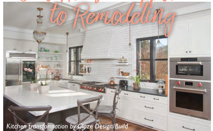
Kitchen transformation by Glaze Design/Build

There's no place like home. It's a place of love and warmth that welcomes you with open arms; where great family memories are made; where you feel comfortable just being yourself. Naturally, you want your home to provide a happy, healthy and safe environment for you and your loved ones. You also want to make wise home improvement decisions that will increase your home's value—such as making it more energy efficient and low-maintenance. At Glaze Design/Build, we are passionate about providing a smooth, holistic approach to the remodeling process for you, while helping you enhance your home for better living.