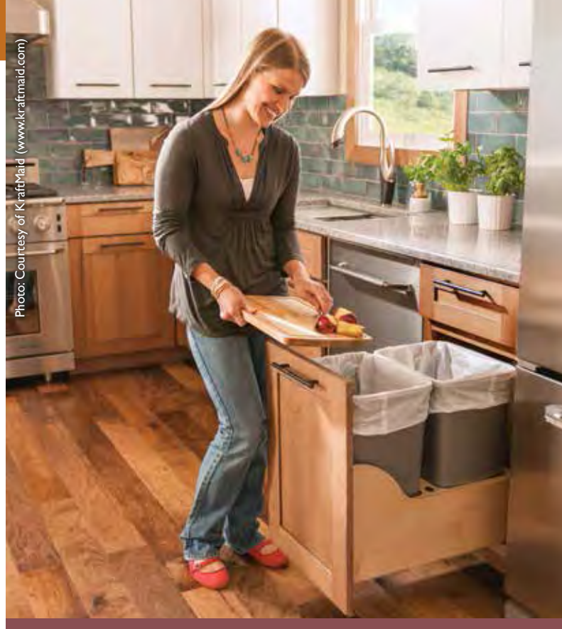
The wastebasket cabinet opens automatically when the cabinet door is nudged gently.

This kitchen also displays current design trends. Using a wide variety of texture—specifically contrasting texture—while keeping the lines clean is a big trend today. Oak is making a comeback, but not the bland "builder's oak" of the past. Creative, artisan finishes are making the grain and texture the star, and the Distressed Ginger finish on these kitchen cabinets is a perfect example. However, too much oak grain can overwhelm a room, and so in this kitchen the addition of cabinets with a sleek glossy finish provides a place for the eye to rest. Either the smooth texture of a painted slab door or a high-gloss thermofoil would accomplish this same objective. Combinations like this are popping up everywhere.